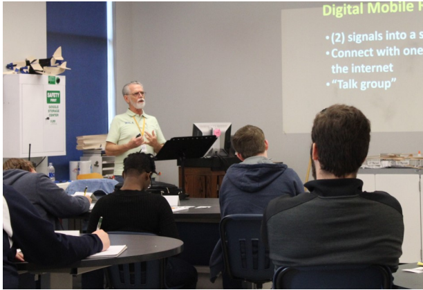
Digital Mobile H